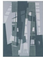
Under Construction 3, Monoprint 30x22