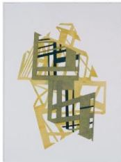
Sectional 1, Monoprint 30x22