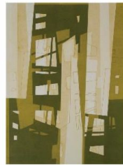
Under Construction 2, Monoprint 30x22