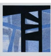
Dockside 1, Monoprint 4x4