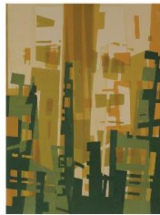
Under Construction 1, Monoprint 30x22