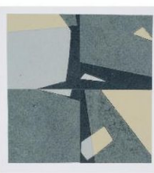
Prefab 2, Monoprint 4x4