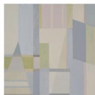
Building Block 5, Acrylic 8x8