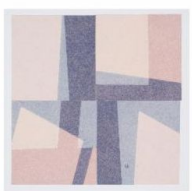
Prefab 5, Monoprint 5x5