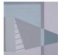
Building Block 4, Acrylic 8x8