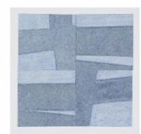
Iceland 1, Monoprint 4x4