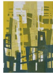
Under Construction 3, Monoprint 30x22