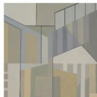
Building Block 1, Acrylic 8x8