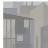
Building Block 3, Acrylic 8x8