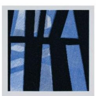
Dockside 3, Monoprint 4x4