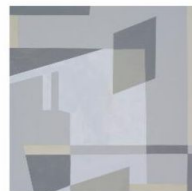
Building Block 2, Acrylic 8x8