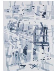
Schema 1, Monoprint 30x22