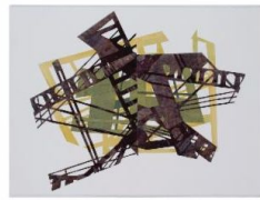
Sectional 2, Monoprint 22x30